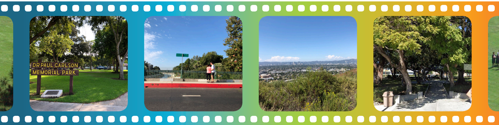
Figure: Open Space Inventory for Culver City

Based on 285 acres, including an additional 193.5 acres of other facilities within City limits.